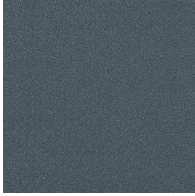
Twilight - 14