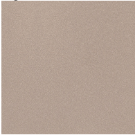
Lagoon - 06