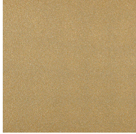
Jazz Gold - 29