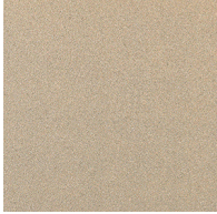
Champagne Cream - 26