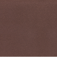
Rusty Angel - 09