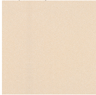
Hampton Bay - 05